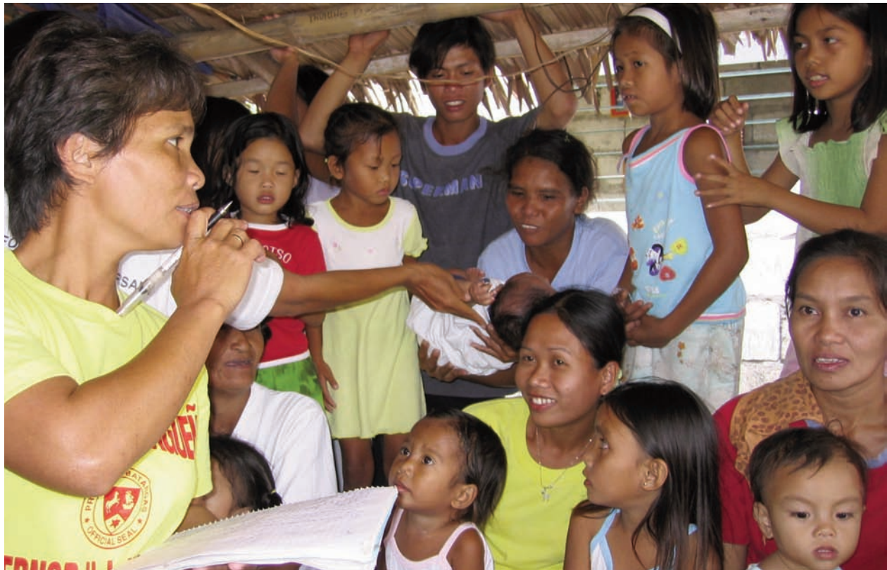
A health worker in the Philippines calls names of girls for weighing.

women represented about 40 percent of all AIDS cases worldwide. However, women are contracting the virus at a faster rate than men, and in 2006, women represented 48 percent of adults living with HIV globally and 59 percent of those in Sub-Saharan Africa. 19