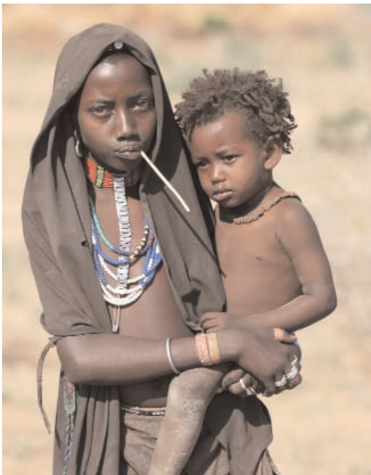
African Woman and Child.

“Women hold up half the sky,” reads an old Chinese saying. Indeed, women have traditionally been the world’s farmers, child bearers, and caretakers of young and old – the backbone of families and societies. Women play a central role in the effective development of families, communities, nations, and regions. Yet, despite their vast contributions to humanity, women continue to suffer from gender discrimination in much of the world. Being born female in most of the developing world means a lifetime as a second-class citizen, denied most of the opportunities available to males in the areas of health, education, employment, and legal rights. This second-class citizenship is detrimental first and foremost to the well-being of women themselves; however, it is also a